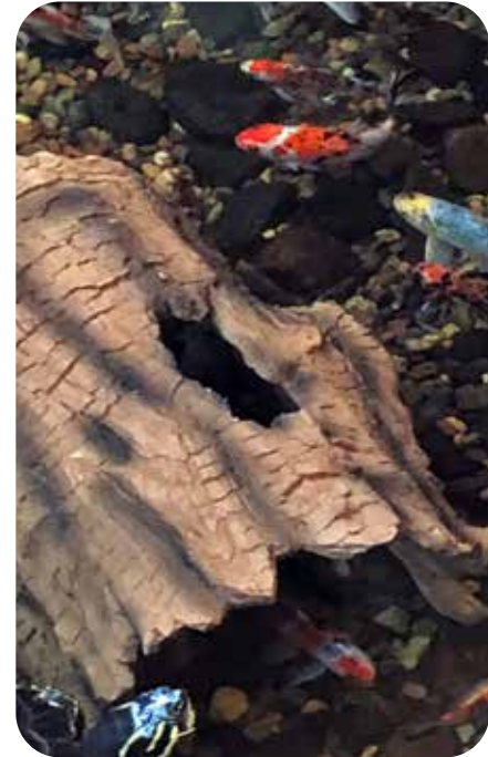
Faux Log Fish Cave