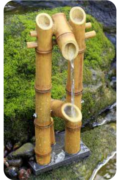
Deer Scarer Bamboo Fountain