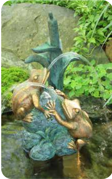
Double Frog with Cattail Spitter

What makes your pond unique? Individualize your water feature with decorative aspects including ornamental spitters and fountains. Whether you prefer a water-spitting frog or bamboo fountain, the possibilities are endless.