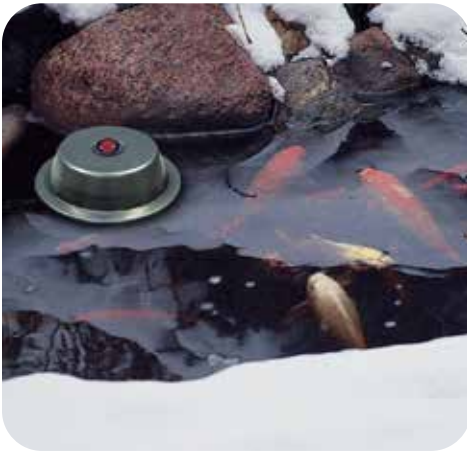
300 Watt Pond De-Icer

Believe it or not, your pond can be extremely beautiful throughout the winter season! Fortunately, winter maintenance is minimal, requiring only a few simple steps to ensure a successful winter season. If you have fish, you must maintain a constant hole in the surface of the ice, allowing for proper gas exchange in your pond. This can be accomplished by using the Aquascape 300-Watt Pond De-Icer , coupled with an Aquascape Pond Aeration Kit and/or Aquascape AquaForce Solids Handling Pond Pump positioned just below the surface of the water. If you decide against running the pump through the winter, we recommend pulling the pump and storing it in a frost-free location. If your water feature contains a shallow stream or waterfall, we recommend checking throughout the season to eliminate ice damming if necessary. These simple steps optimize the health of your pond throughout the winter.