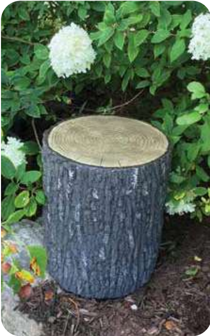
Faux Oak Stump Cover

Aquascape also offers other decorative elements to enhance your water feature. The Faux Oak Stump Cover is perfect for hiding electrical components, while our Faux Driftwood is ideal for concealing biological and skimmer filters. The Faux Log Fish Cave can be used inside your pond to protect your finned friends from predators - or use it near the pond as a decorative element in the landscape.