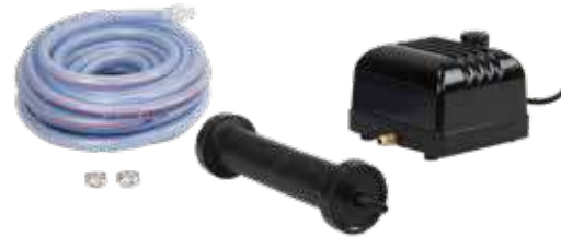
Pro Air 20 Pond Aeration Kit