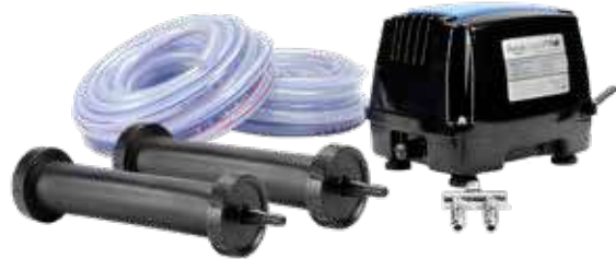
Pro Air 60 Pond Aeration Kit