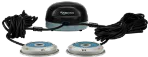
2-Outlet Pond Aerator

Oxygen is necessary to the success of your new ecosystem pond. While your waterfall will help supply sufficient oxygen levels, adding additional aeration will enhance the pond by optimizing water quality and clarity, helping to create an extremely stable environment for your fish and plants. Aquascape offers four separate options so you can choose the aerator that suits you and your pond best.