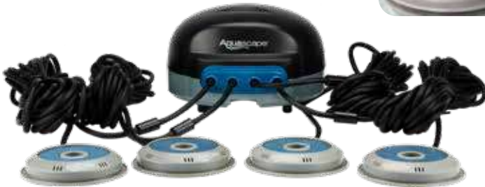
4-Outlet Pond Aerator